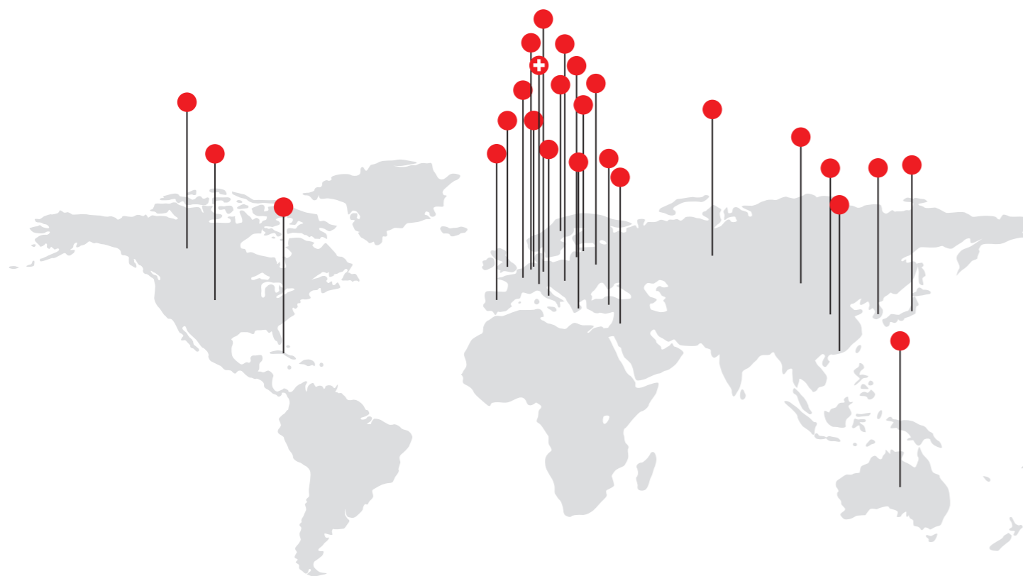
Countries where UMS 'n JIP / UMS 'n JIP's works has / have been performed